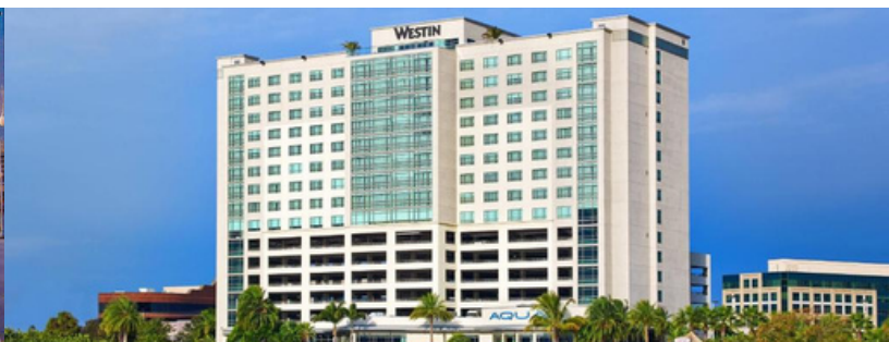
OFFICIAL SHOW HOTEL: TAMPA WESTIN WATERSIDE